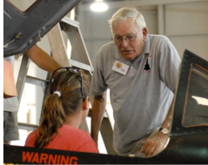
Sure!! You can be an associate member. Scoot over and I'll show you how we flew buddy flights in the A-12