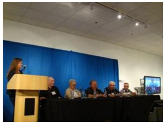
Panel #2 Moderated by Annie Jacobsen